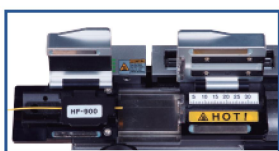
Stripping (No Cracks on Fiber)