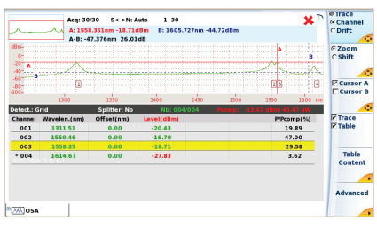
Automatic pass/fail results