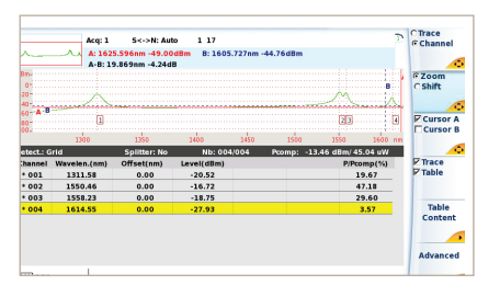
Spectral measurement displays trace and table

Furthermore, its tunable channel grid allows not only to measure according to the ITU-T G.694.2 CWDM wavelengths but also to use your own customized grid.